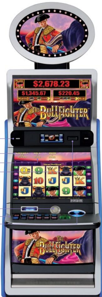
This machine is for illustrative purposes only, all gaming machines are different.