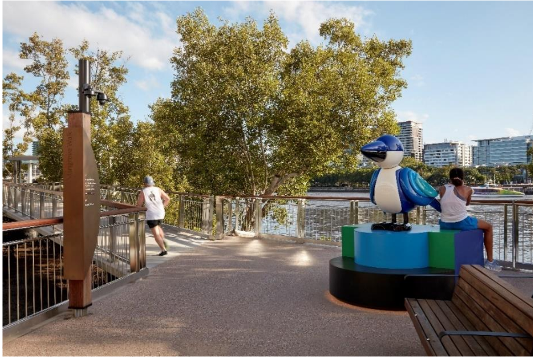
Image: Mangrove Walk